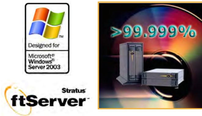
Figure 2: Automatic 99.999% Uptime for Windows Environments

Windows applications benefit from Stratus continuous availability and operational simplicity the minute they are loaded onto the system.